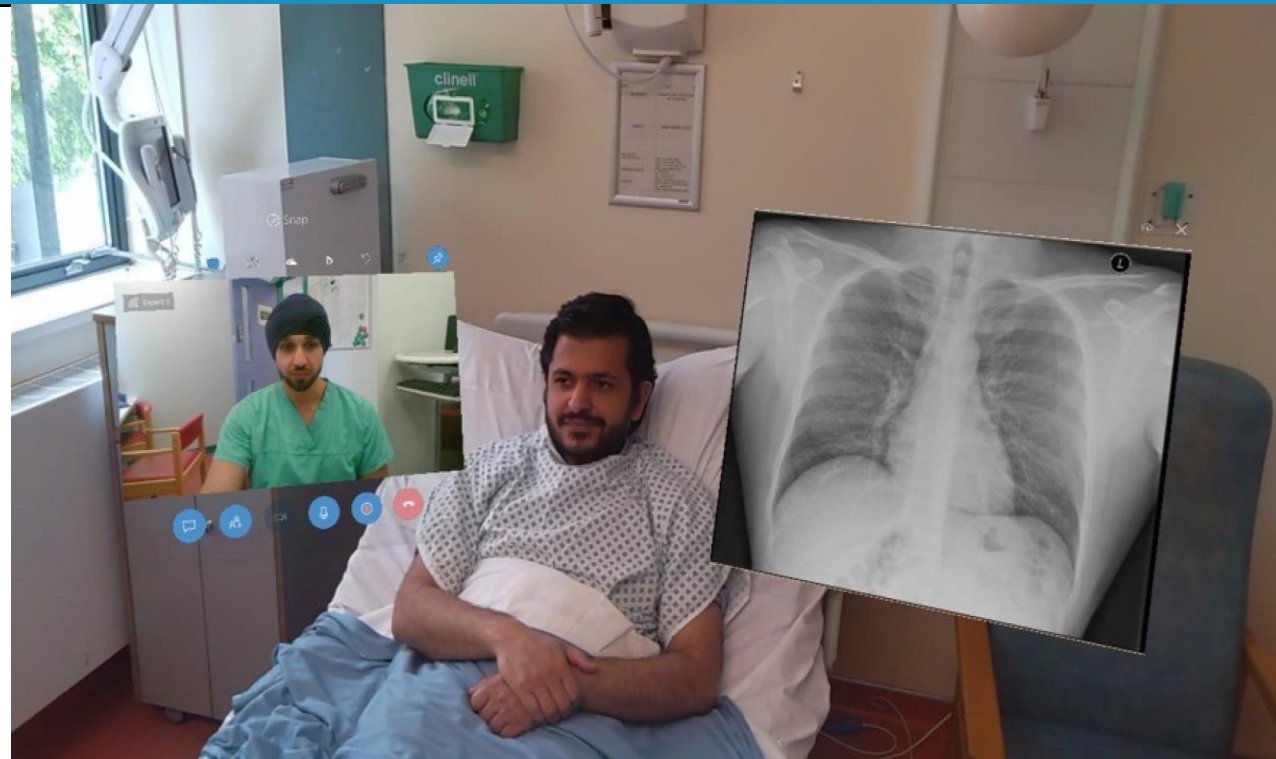
Image 2- What the user see's

Our preliminary pilots utilising HoloLens have been successful and presented at 3 conferences in 2021 (ASME, RCP annual conference and USA). This showed high level of student satisfaction as brought a clinical scenario streamed real time and allowed them to interact with the HoloLens user and patient whilst they were remote as during COVID 19 restrictions. Augmented reality medical student teaching within primary care | RCP Journals