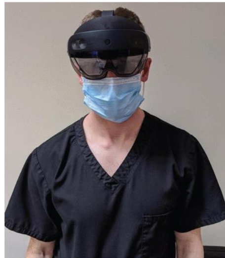
Image 1- User wearing HoloLens

The HoloLens provides a unique teaching tool that can bring students/staff situated remotely and be directly involved in simulation. They can see; first perspective view of the wearer in high definition (see image 1), others on Teams, clinical information, and Bluetooth linking to instruments of examination i.e. Bluetooth stethoscope. The HoloLens infra-red scanning function allows you to place any information (Observations, blood test results, X-rays etc..) anywhere in the room as augmented reality. This allows real-time interaction with the simulation and environment, whilst not needing to step on site (see image 2)